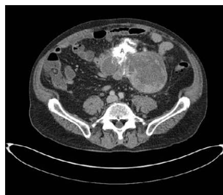
Figure 1: Computed tomography axial slice at level of mass showing heavily calcified nidus (A), measuring 5.5 cm with fibrotic reaction and extensive spiculation extending into the mesentery.

Extraskeletal Osteosarcomas (EOSs) are exceedingly rare,